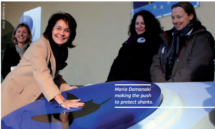
Maria Damanaki making the push to protect sharks.

Deep-sea fish , that are extremely vulnerable to fishing pressure, have been at the centre of our efforts to phase out destructive practices. Although the state of important stocks like black scabbard fish and roundnose grenadiers has been improving lately, we want to make sure that their fishing is fully sustainable and has minimum impact on the fragile deep-sea environment. In 2012 the EU became the first fishing party in the world to envisage the protection of the deep-sea environment at regulatory level by adopting a proposal to phase out bottom trawling and bottom-set gillnets in this particular fishery.